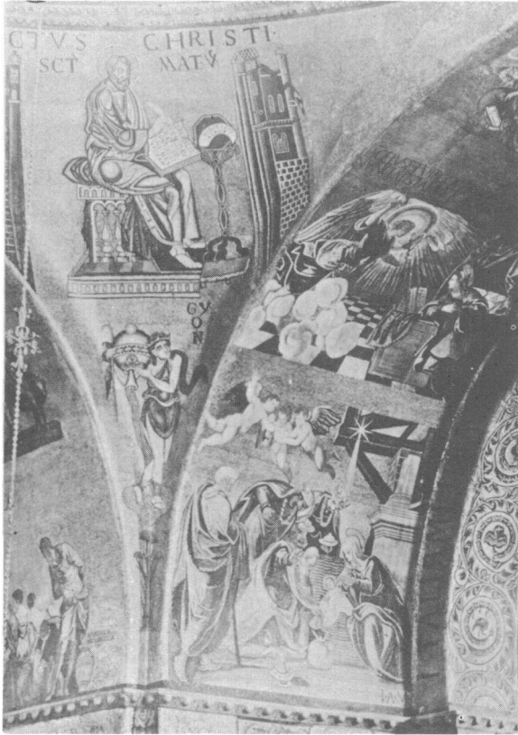
FIGURE 1. One of the four spandrels of St Mark's; seated evangelist above, personification of river below.

The design is so elaborate, harmonious and purposeful that we are tempted to view it as the starting point of any analysis, as the cause in some sense of the surrounding architecture. But this would invert the proper path of analysis. The